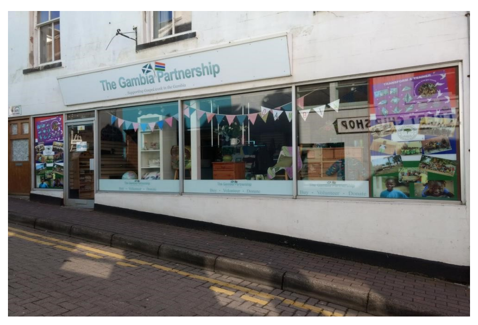
SHOP / DONATE / VOLUNTEER 7-9 CHURCH STREET, STORNOWAY

For more information, please check out the website: